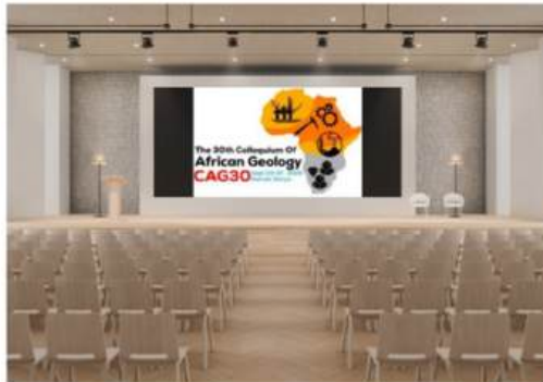
A 4-day Conference

A unique chance to network & connect with Geo-industry leaders