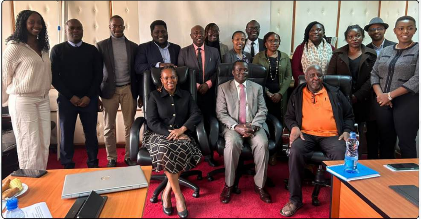
Domestic Advisory Group (DAG) meeting on Kenya European Union Partnership Agreement (EPA)